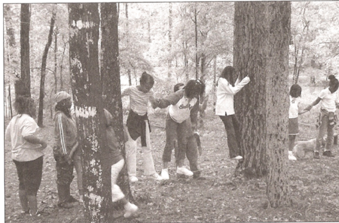
The participants of Made 2B More practiced team-building activities at their first group retreat at Camp Westminster in Conyers.

“I think the program is great and very educational,” said Ivory, who lives in Forrest Park.